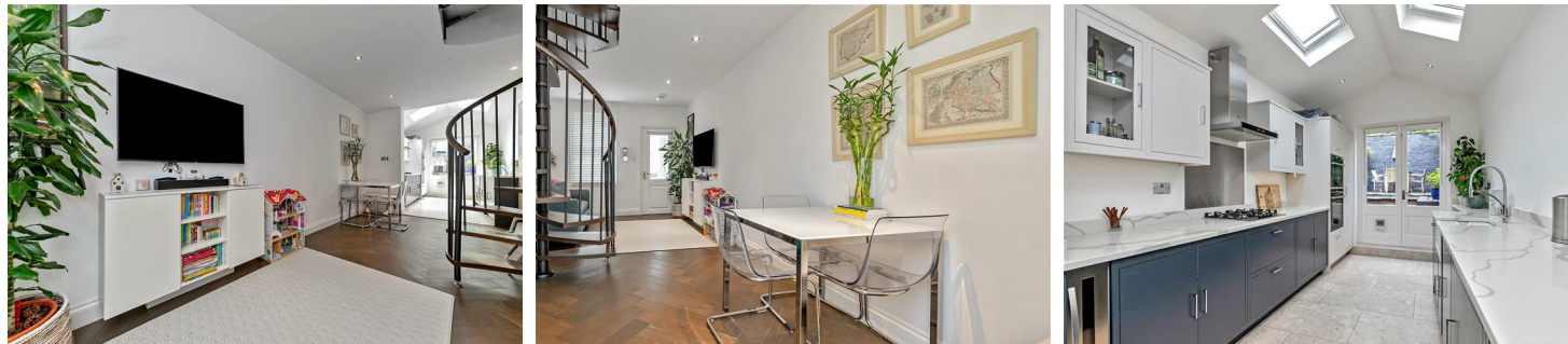
Ground Floor Approx. 31.2 sq. metres (335.8 sq. feet)

Nestled between similar character cottages is this attractive two bedroom, two reception room terraced property, located in the heart of the conservation area with views overlooking the 'Old Brickie' Park and the rare advantage of off road parking. This pretty cottage has a contemporary feel as you step inside with accommodation arranged on two floors. The ground floor comprises of an entrance porch, a 20ft lounge/diner open to the stylish fitted kitchen area. A fabulous spiral staircase leads to the first floor where the master bedroom, a further bedroom and a trendy shower room can be found. The combination of some old tradition such as xylo-herringbone wood flooring, sash style windows and custom made spiral staircase are fused with modern day luxuries including underfloor heating in some living areas, sleek Harvey Jones fitted kitchen cabinetry complemented by integrated Neff appliances and a lavish fitted C.P Hart shower suite. To the outside is a lovely low maintenance courtyard style rear garden with the rare benefit of side gated access leading to the front of the property. To the front of the property is a 'cobbled' style driveway providing off road parking for one car. New England street is an enviable address as it gives easy access to the city centre with its extensive shopping and leisure facilities and is near to the mainline railway station.